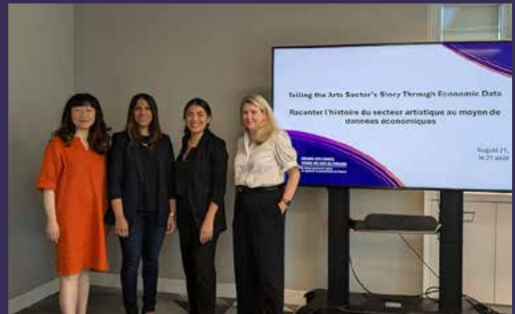
This summer, we offered a training session on how OAC can harness and use data for powerful storytelling about what the arts sector contributes to the province's economy and collective quality of life.

We also offer in-person and online information sessions on applying for arts funding, covering topics like eligibility, the peer assessment process, and grant writing tips. For example, we offered specific CADAC (Canadian Arts Data / Données sur les arts au Canada) training. These sessions are hosted by OAC, or in collaboration with other organizations. Additionally, our staff frequently participate in public presentations and panel discussions to support the arts sector.